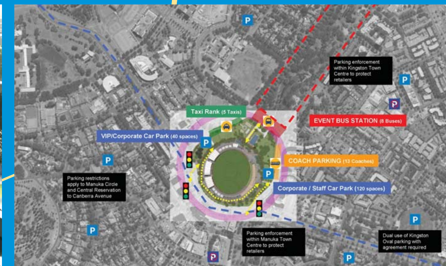
INDICATIVE EVENT TRANSPORT MASTER PLAN