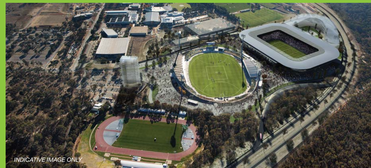
INDICATIVE IMAGE ONLY