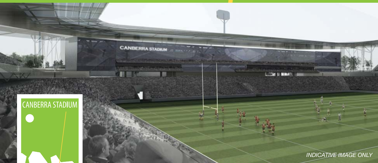
INDICATIVE IMAGE ONLY

Indicative construction cost $300-350 million